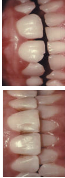
Figure 1. Healthy Gums Figure 2. Gingivitis

Your dental professional will also assess the ability of the gums to heal, and discuss the required treatment with you.