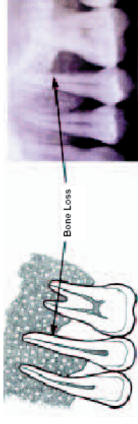
Figure 5. Bone loss

To further confirm the presence of periodontal disease, your dental health professional may take X-rays. X-rays reveal information that cannot be seen by the naked eye and therefore help the dental health professional in making an accurate diagnosis.